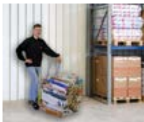
Bale removal and transport with discharge trolley