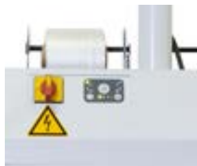
Microprocessor controller with membrane keypad