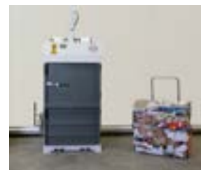
Low installation height and small footprint